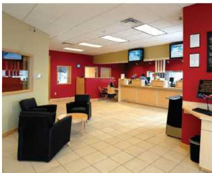
Employees at your local bank can help you choose the bank account that best meets your needs.

T In this activity, you will work with a partner to research and compare banking services.