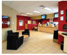
Employees at your local bank can help you choose the bank account that best meets your needs.

T In this activity, you will work with a partner to research and compare banking services.